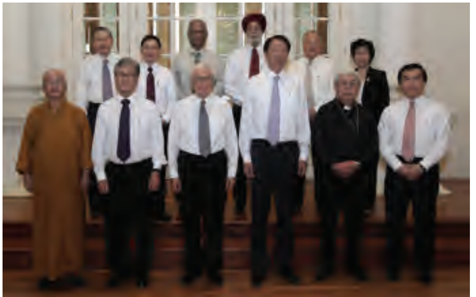
President Tony Tan Keng Yam (third left) and Deputy Prime Minister and Minister for Home Affairs Mr Teo Chee Hean (third right) with members of the Presidential Council for Religious Harmony.