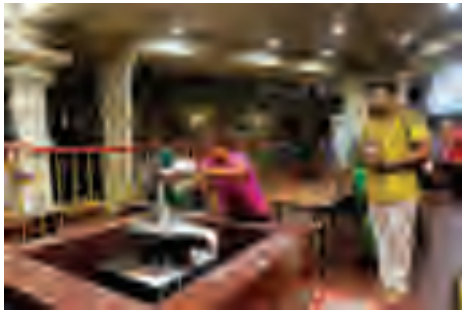
A devotee offering prayers