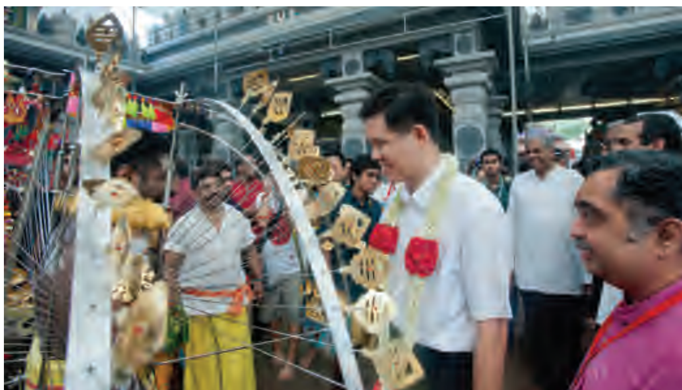
Acting Minister for Community Development, Youth and Sports Mr Chan Chun Sing at the Thaipusam 2012 festival in Sri Srinivasa Perumal Temple.