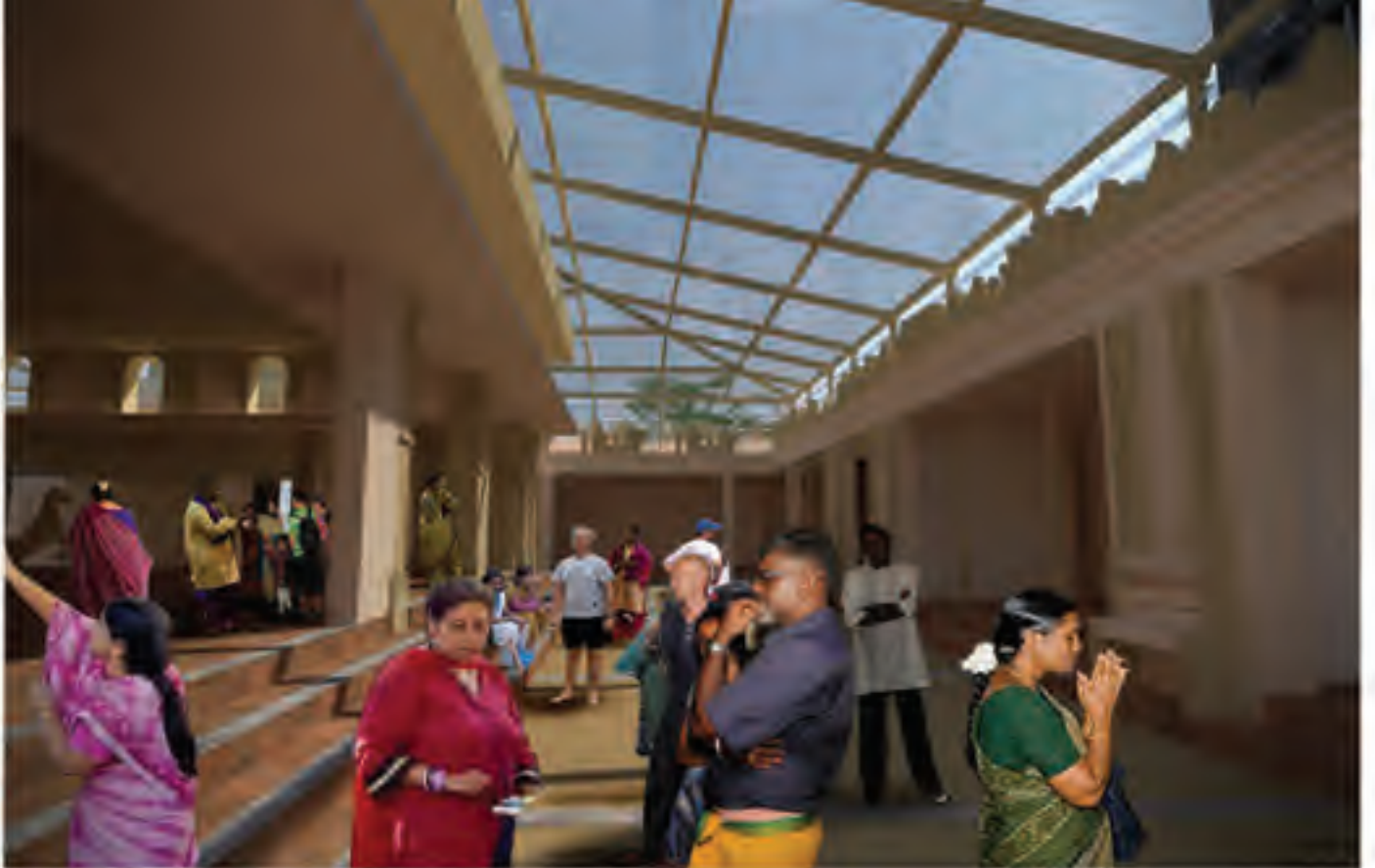
Illustration of the skylight roof over the open airspace adjoining the sanctums

One of our Hindu Endowments Board administered temples, the Sri Vairavimada Kaliyamman Temple has grown in patronage as a result of an influx of Hindu residents in Toa Payoh and the surrounding housing estates like Bishan and Ang Mo Kio.