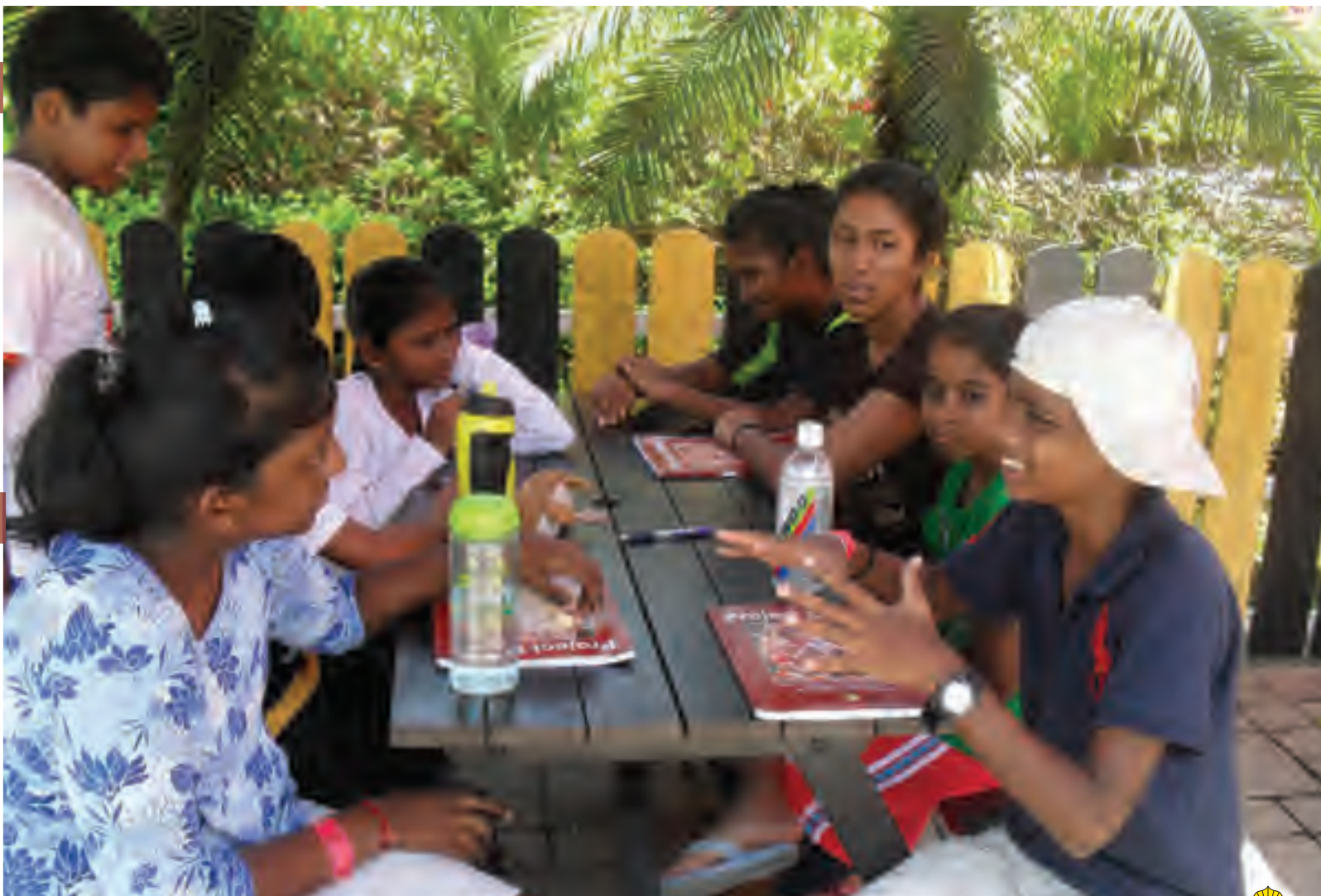
Teens class at the beach with students debating on how cool Hinduism is