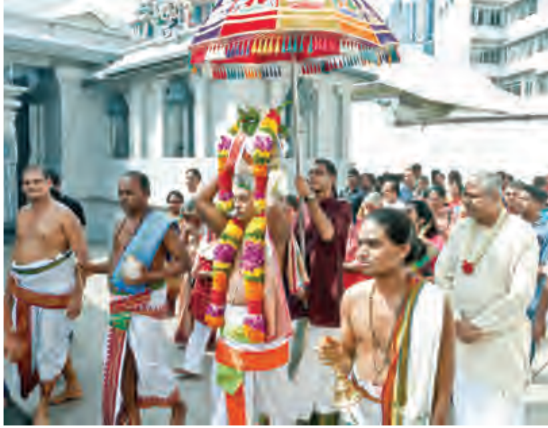
Mass devotee participation at the Sahasra kalasabishegam.

The Sahasra kalasabishegam was held on 17th June 2012 and the participating devotees re-ceived the blessed kalsam which was used during the ceremony. On the same evening, a celestial wedding or thirukalyana mahot-savam was held for the Lord and his consorts.