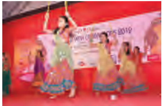
A cultural performance by young artistes.

Boishaki Utsob or Bengali New Year celebrations on 22 April drew massive crowds with cultural performances by various Bangladeshi and North Indian organisations. Medical screening for new citizens, a blood donation drive and an anti-addiction awareness campaign against alcoholism and smoking were also featured.