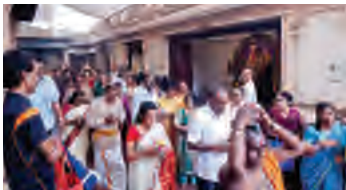
Minister for Foreign Affairs and Minister for Law Mr K. Shanmugam (in white shirt) at the Sree Bhagavathy Amman prayers.

Singapore was once again blessed with the Ceremonial Visit by the Divine Deity of Goddess Sree Bhagavathy Amman from the famous Chakkulathukavu Sree Bhagavathy Amman Temple from Kerala – India from Thursday, 08 March 2012 to Sunday, 11 March 2012. The four-day event was organised by Sri Vairavimada Kaliyamma Temple and the Singapore Malayalee Hindu Samajam with the support from the Hindu Endowments Board, Sri Srinivasa Perumal Temple and the Chakkulathukavu Sree Bhagavathy Amman Temple in Kerala – India.