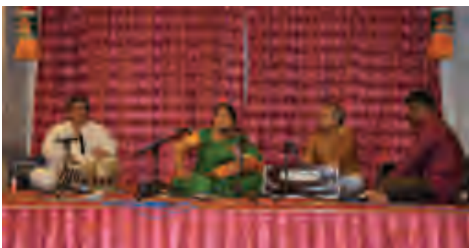
'Hori' music performance

'The abode of Lord Siva in Singapore was transformed into Vrindavan as we watched the antics of Lord Krishna playing Holi' remarked an appreciative guest.