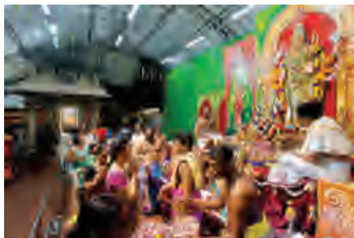
Devotees offering prayers to Goddess Sree Bhagavathy Amman.

The key event was the preparation of 'Pongala' by hundreds of devotees at the Perumal Temple grounds. The 'Pongala' is the signature event of the Bhagavathy Amman Temple @ Chakkulathukavu Temple.