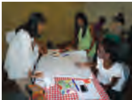
Volunteer teachers undergoing training

The highlight of the PB programme is the annual carnival for students, which is usually held in September. Students from all PB centres come together for a day of fun-filled games, quizzes and competitions. A grand carnival has also been planned this year to mark the 10th Anniversary of PB. Not only has the PB programme gained popularity with Hindus, lately, it also welcomed a pair of Polish sisters who can chant mantras and sing bhajans as eloquently as their Hindu counterparts!