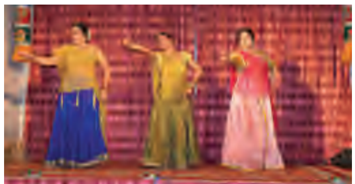
Vibrant Kathak dance performance