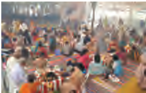
Prayers being offered at the Gita Jayanti festivities.

Conducted under the auspices of the Hindu Endowments Board in asso-