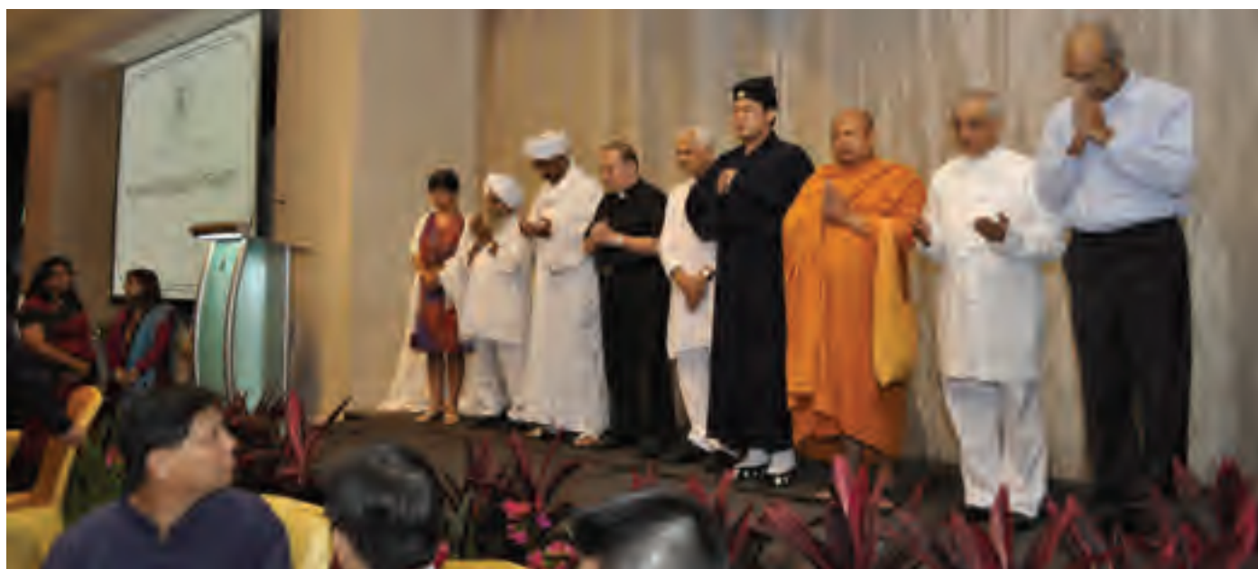
IRO representatives offering blessings at the Charity Dinner

The Hindu Endowments Board (HEB) made its contribution towards the $100,000 raised by the Inter-Religious Organisation (IRO) at a charity dinner held to celebrate IRO's 63rd anniversary. The guest of honour was Mr S R Nathan, the sixth president of the Republic of Singapore who was appointed as the first patron of the IRO.