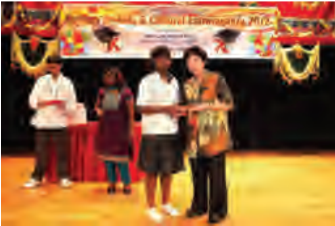
Mrs Lim Hwee Hua, Advisor to Serangoon GRO, presenting the awards.

Each year, some of the Hindu temples in Singapore award financial assistance to the needy and deserving students for their education, ranging from primary level to JC/poly levels.