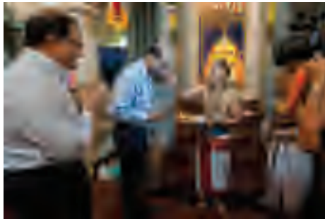
Mr Tharman Shanmugaratnam (second left) and Mr S Iswaran (left) receiving blessings from the temple priest.