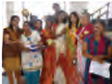
Some of the dedicated and enthusiastic teachers