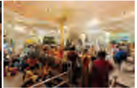
Devotees at the Mahashivarathri Festival.