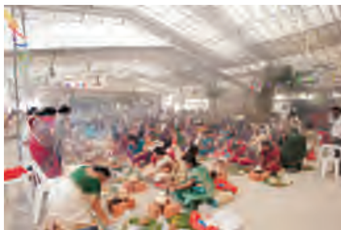
Devotees preparing for the 'Pongala' celebration at Perumal Temple.